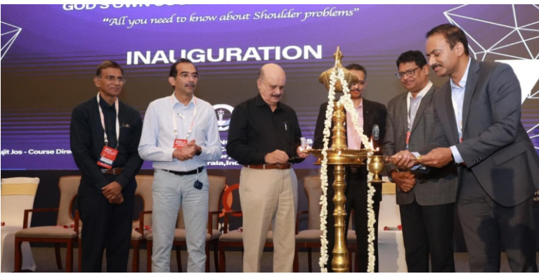
God's Own Country Shoulder Course 2023