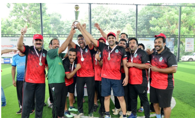
COS won the CALLUS Cricket Runners up trophy