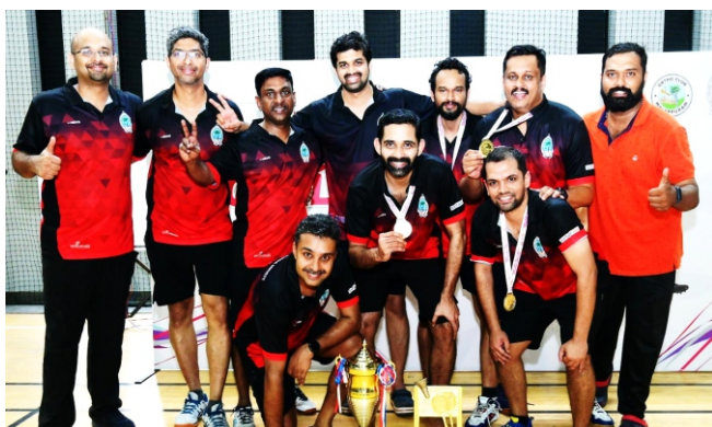
CALLUS Badminton Champions - COS