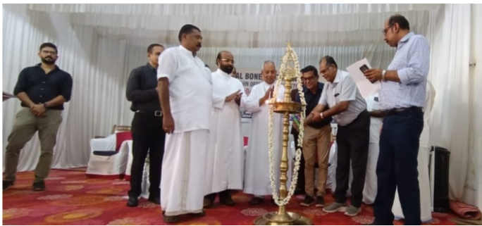
COS Medical Camp & Bachelor's Night at Kasargode