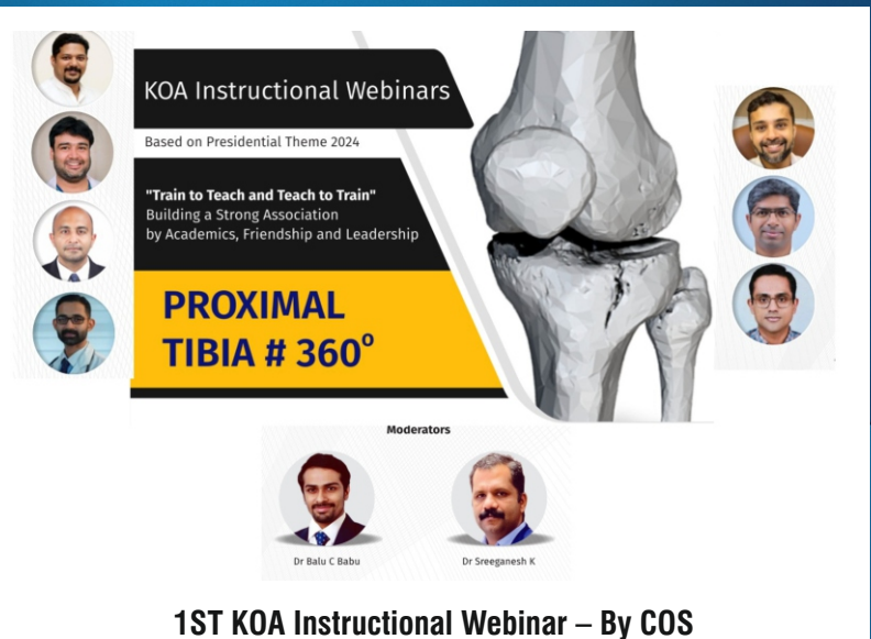
1ST KOA Instructional Webinar – By COS