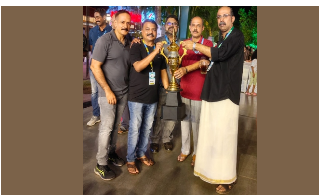
Lifting the Runners up Trophy of 1st KOA Annual sports meet – CALLUS held at Perinthalmanna “COS Kochi Machans”