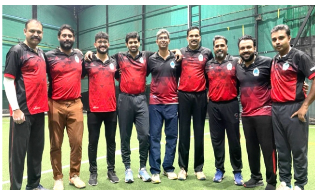
COS won IMA Cricket tournament