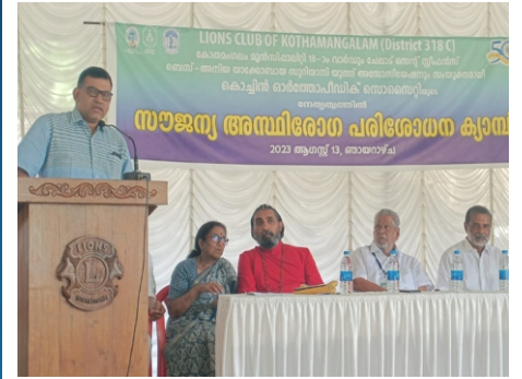
COS Medical Camp & Bachelor's Night at Kothamangalam