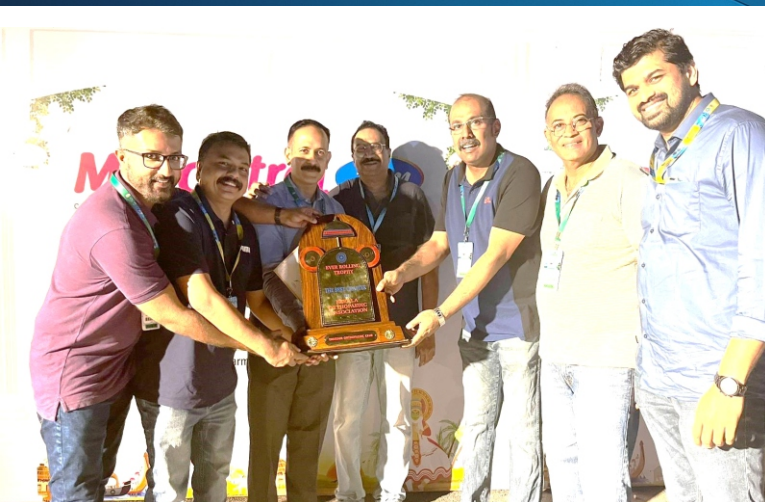
The Best Chapter of Kerala Orthopaedic Association in 2022-23 "The Cochin Orthopaedic Society"