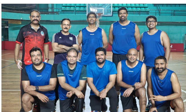
COS won IMA basketball Finals