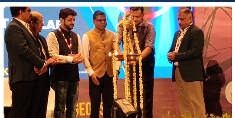
AOPAS 2024 - Kochi