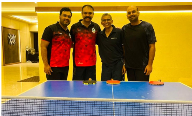
COS won IMA Table tennis