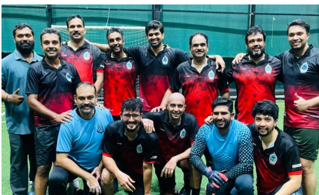
COS won IMA Football tournament