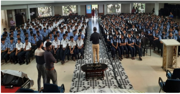
BLS training conducted @ Rajagiri Higher Secondary School, Kalamassery & Chinmaya Vidyalaya, Kannamali