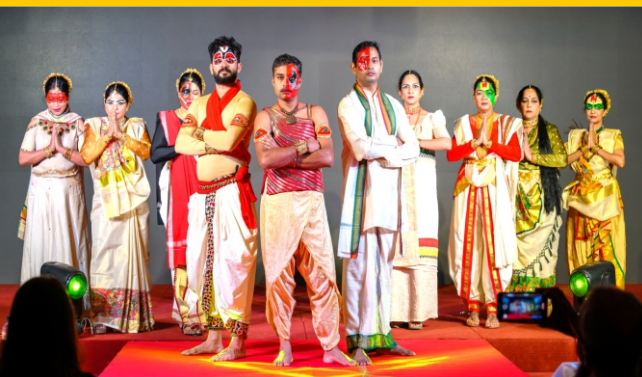
COS organised OSTEOLAST (1st Cultural Program of KOA)