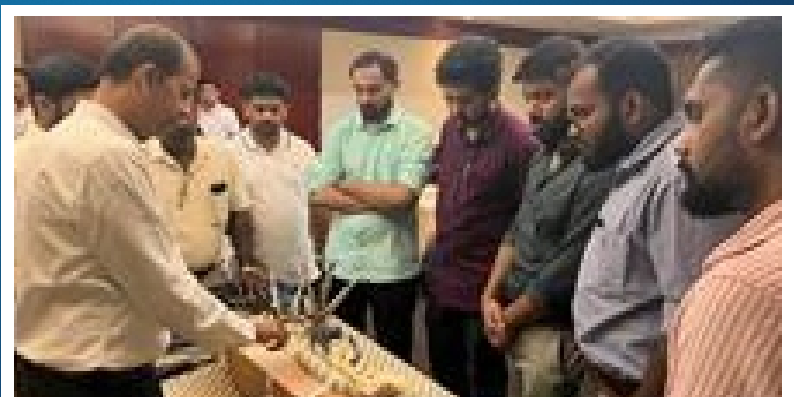
Kochi Spine Course