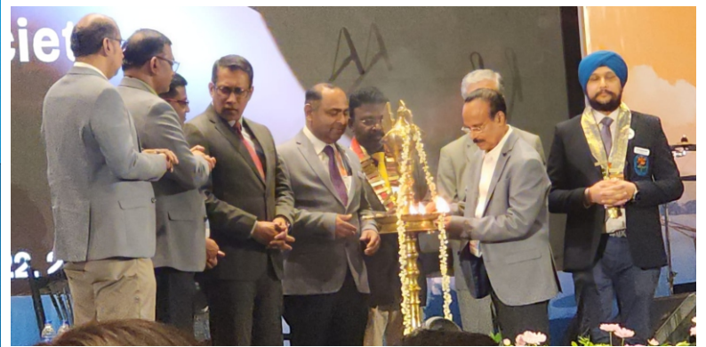
IFASCON 2024 - Kochi (National)