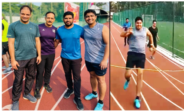
COS in Athletics