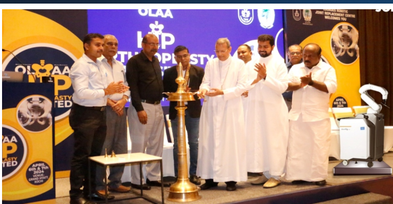
OLAA Hip Revisited 2024