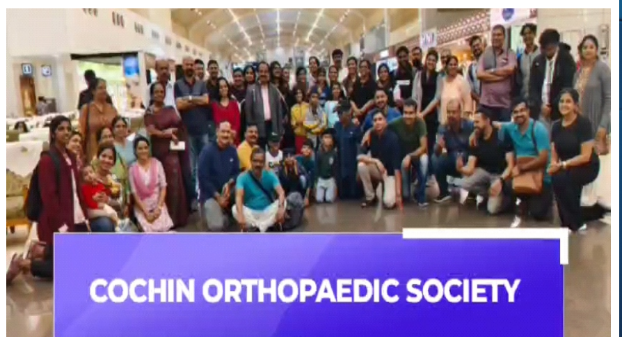
"The Cochin Orthopaedic Society "THE GRAND FAMILY GET TOGETHER"