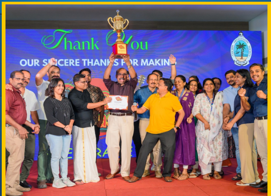
OSTEOLAST Overall Championship - 1st Place - COS